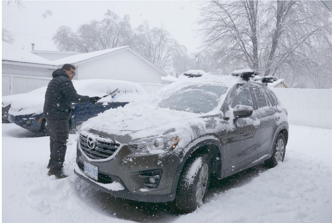
April snow: https://youtu.be/lZHUyH127s