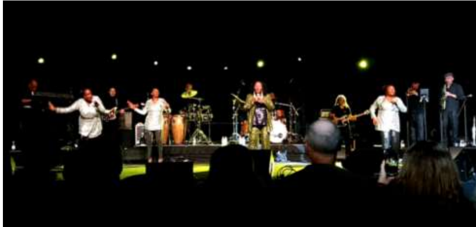
Video: Boney M in Peterborough