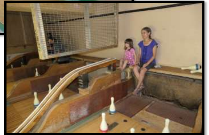
Video: Family Bowling

For this year's picnic we rented the Minesing bowling alley. So much fun!