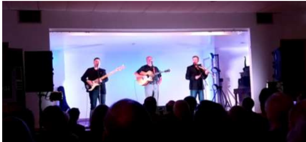
Video: Irish Descendants in Fenella