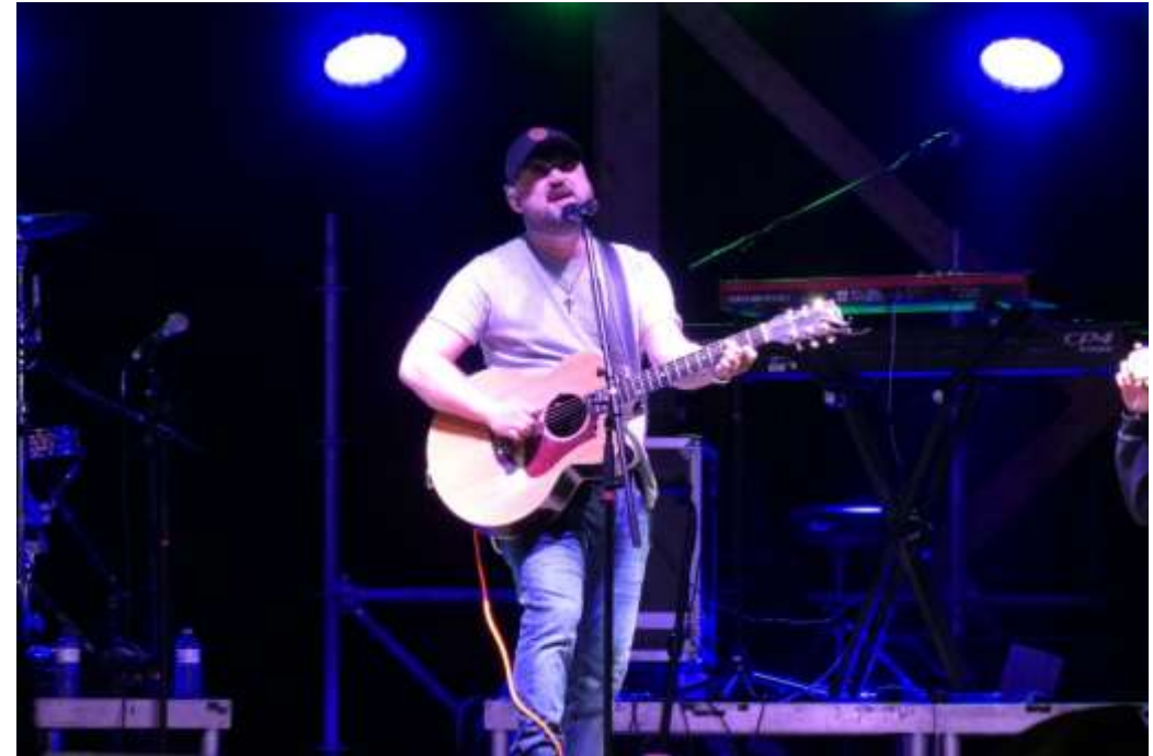
Video: Crooks Rapids Countryfest (warning, very long video)