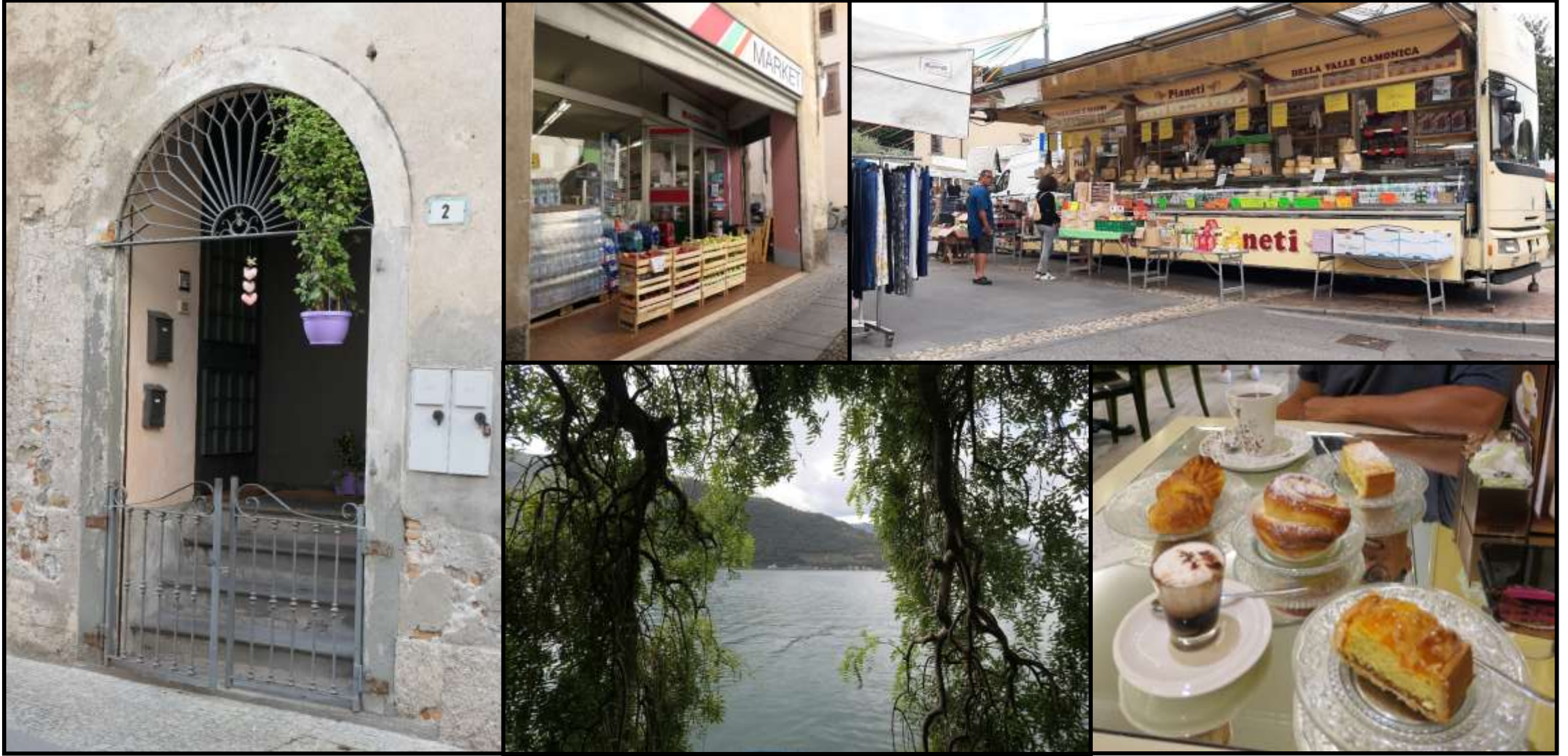
Street scenery, our local grocery, buying cheese on market day, a view of the lake, and samplings from the local bakery.