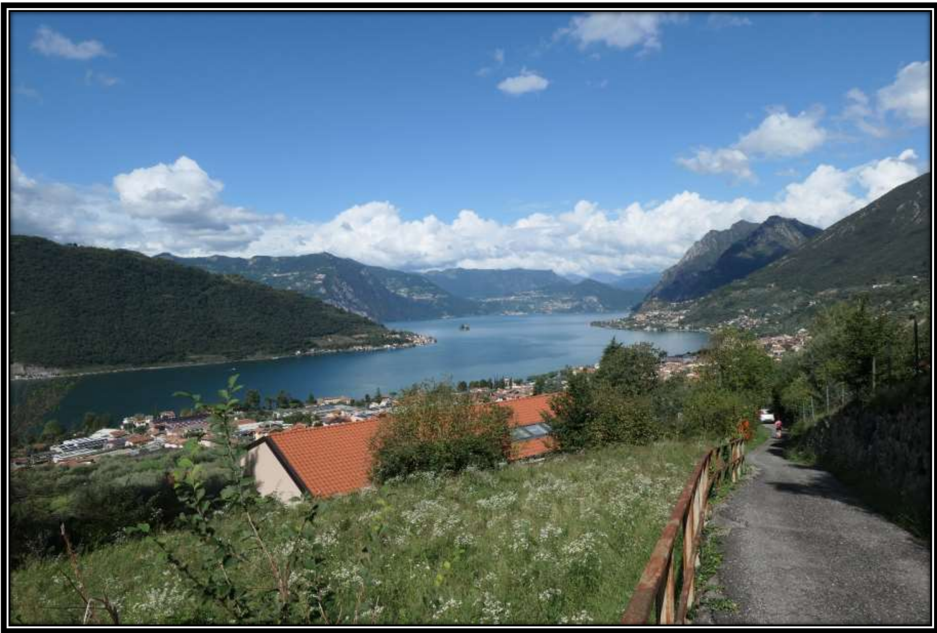
Hiking south to Tassano: view of Monte Isola, Lake Iseo, and surrounding villages.