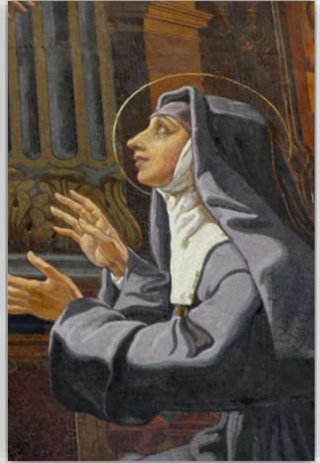
Mosaics in St. Peter's Basilica, and the view of St. Peter's Square from on top of the Basilica.