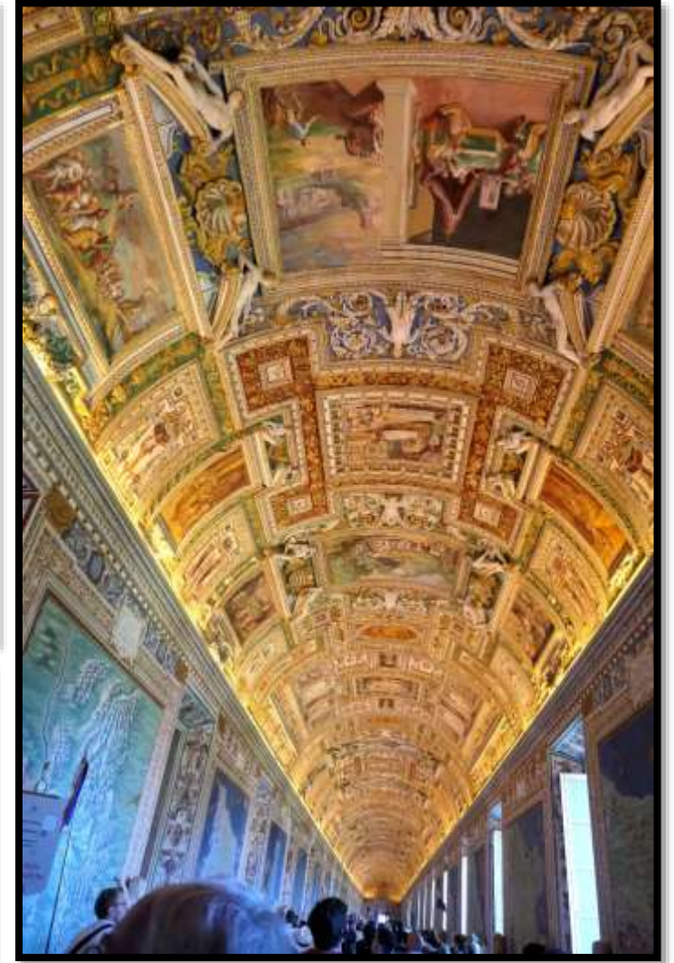
The Round Room with Porphyry Basin, Laocöon and Sons with Serpents, marble table, sarcophagus, Gallery of Maps ceiling.