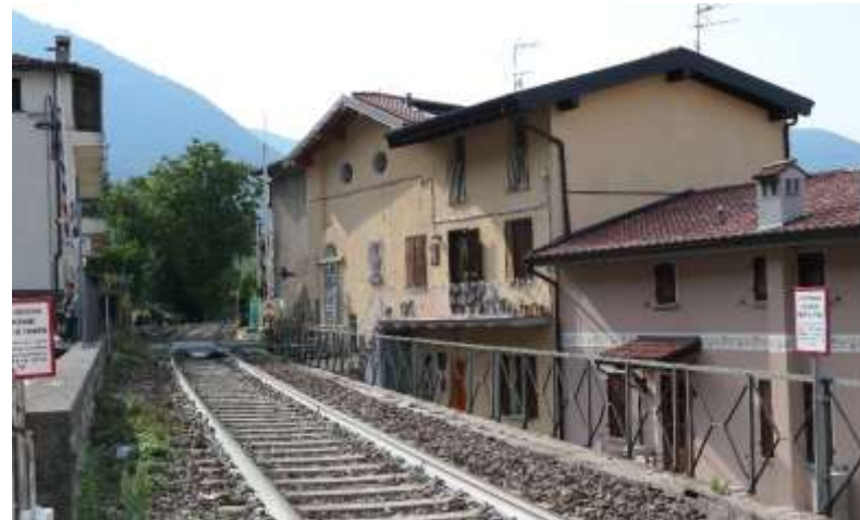
Video: Trenord Train Out Our Window