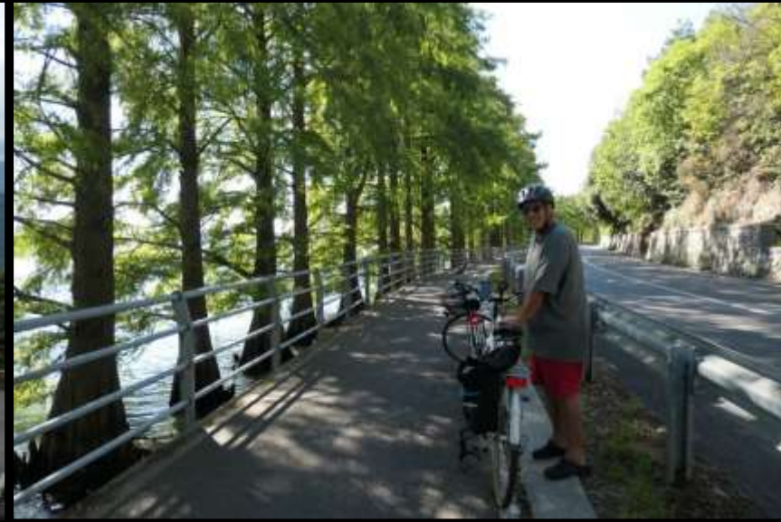
Video: Cycling Sale Marasino to Sarnico with a scary tunnel (warning - very long video!)