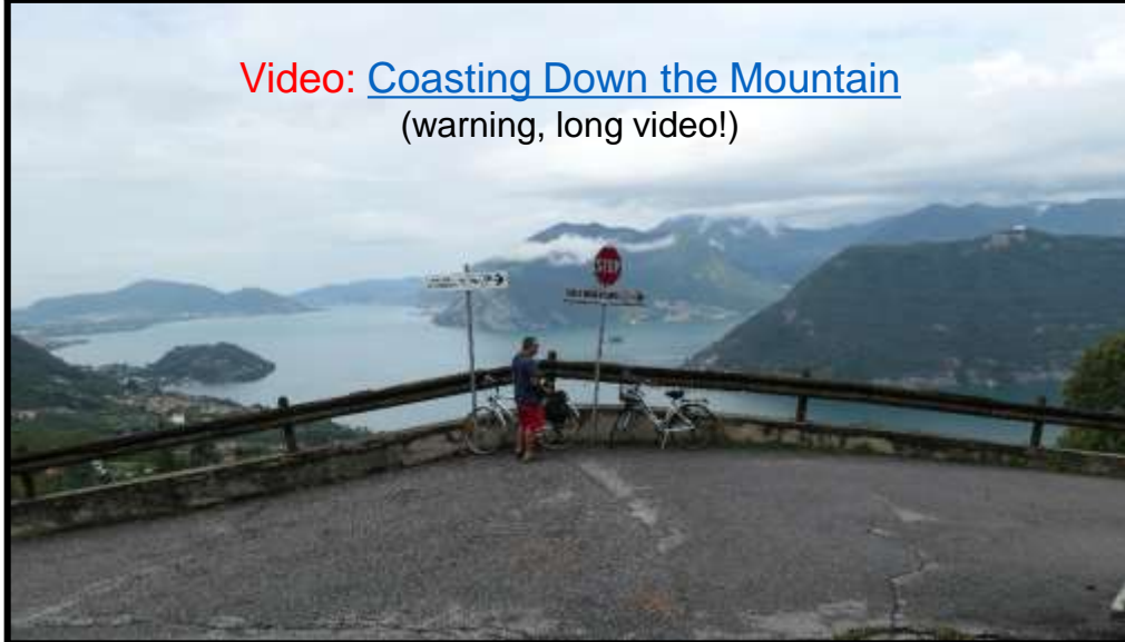
Video: Coasting Down the Mountain (warning, long video!)