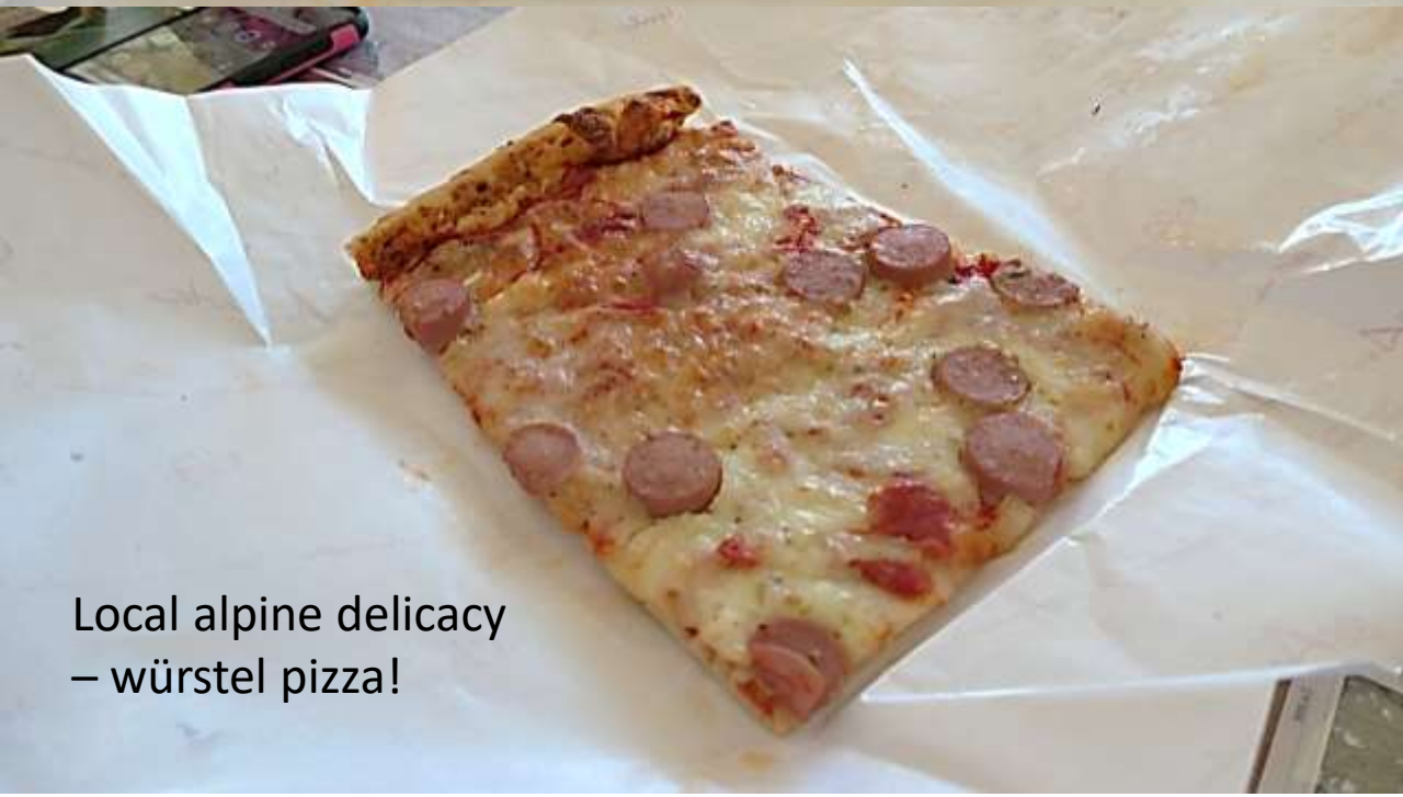
Local alpine delicacy – würstel pizza!