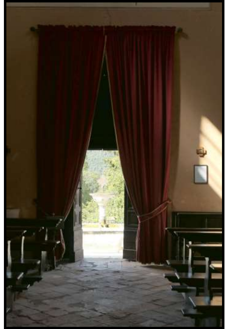
Maspiiano village and its church – Chiesa di San Giacomo